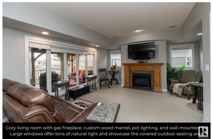
Cozy living room with gas fireplace, custom wood mantel, pot lighting, and wall-mounted TV. Large windows offer tons of natural light and showcase the covered outdoor seating area.