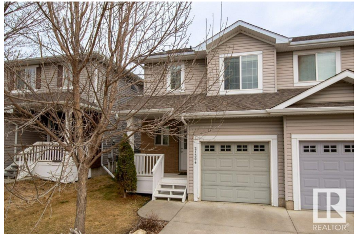
21304 45A Ave NW, Edmonton, AB

No condo fees! Excellent and quiet location in a crescent in The Hamptons. 2 storey Half duplex over 1,229 sf plus a full basement. Big private fenced yard with deck and plenty of sunshine. Attached garage with front drive pad. Hard wood and tiled floors. Huge kitchen with plenty of cupboards and a raised breakfast bar. Spacious Dining Room with patio doors overlooking a sizable deck. Master bedroom with 3 piece ensuite and linen shelving. Good sized extra bedrooms. So close to Granville Costco, Kim Hung Bilingual School and other programs. Perfect for young families and professionals. Priced to Sell!